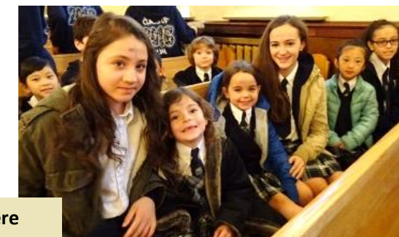
Grade 7 students were present with their kindergarten buddies.